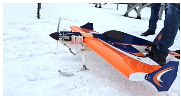
Tom's Aeroworks profile plane is ready for snow!

This Year's FFFFFFFFFFFFFFFFFFFFFFFFFF should be memorable since we are expecting 10 to 15cm of snow on Thursday evening. So there will be lots of snow to play in on Saturday morning. Don't let that stop you from coming out. You can always hand launch, use floats or better still strap on or make up a set of skis for the event. Tom's Aeroworks is chomping at the bit to fly.